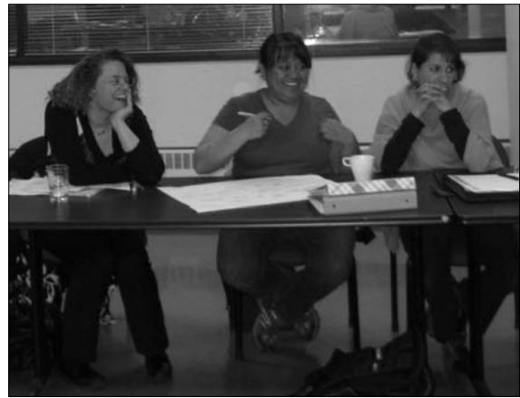
working on a group project in the Ryerson course